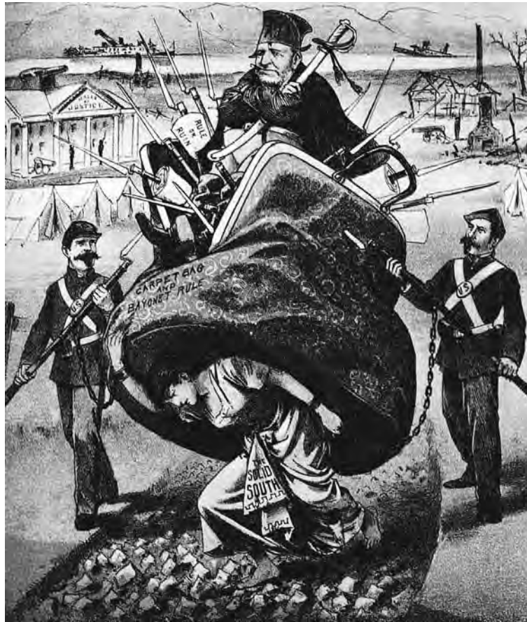
A cartoon published in 1880. The person sitting in the carpetbag is ex-President Grant, who was being considered by the Republicans as a Presidential candidate for the 1880 Presidential election.